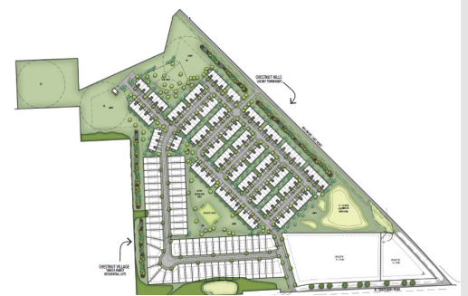
Site Plan for Chestnut Hills Development

It is a beautiful time to live in Northfield Township. We have countless businesses moving into our downtown, development in our Research, Technology and Manufacturing corridor, and the first residential development in over two decades at N. Territorial & Whitmore Lake Road. The township board has made it a priority to clean up the community, and it has been a great success so far. We have eliminated old signs, removed blight throughout the downtown, and guided businesses in cleaning up their property. None of this could have been accomplished without the ongoing support from great community members like yourselves.